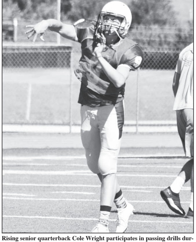
ing spring practice last week.

Our priority this spring is to get our offensive line headed in the right direction and finding the five guys that will give us the best chance to be